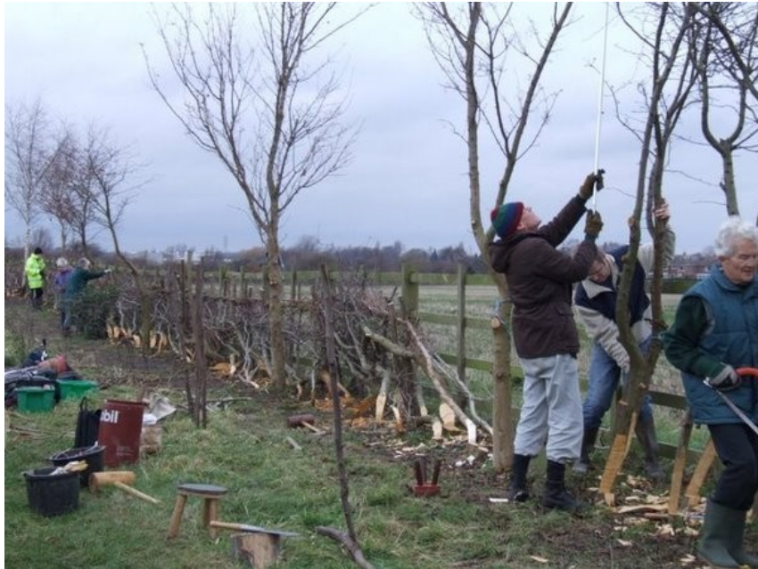
Hedge laying at Rushcliffe Country Park