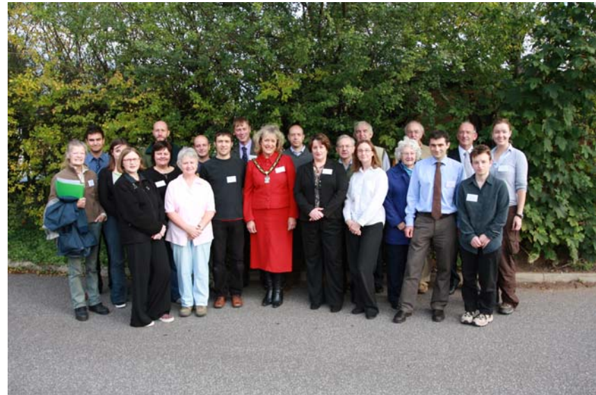
Nott's BAG Annual Forum Event 2008 - Bramcote