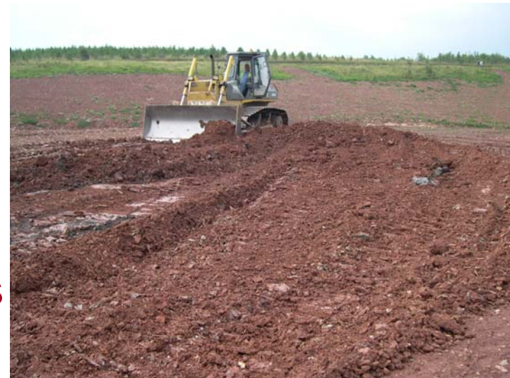
Restoration Work at Shirebrook