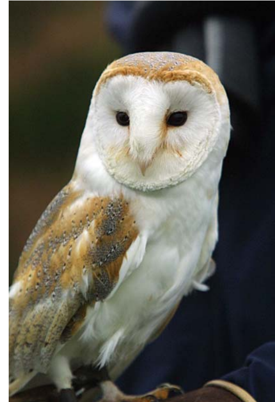
Speedy the Barn Owl