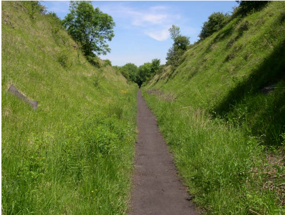
Teversal Trails - SSSI, SINC and LNR