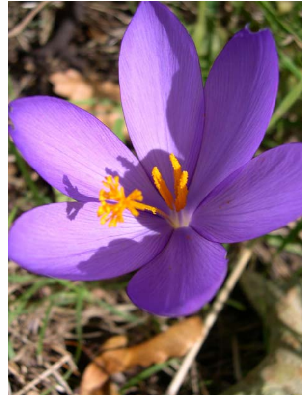
Nottingham Autumn Crocus