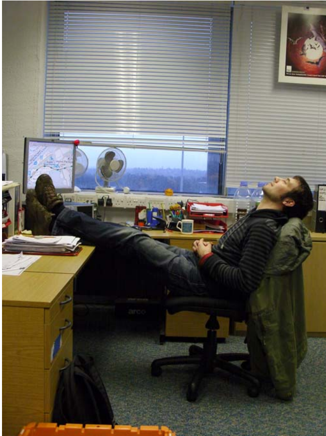
LBAP Coordinator at rest in his natural habitat