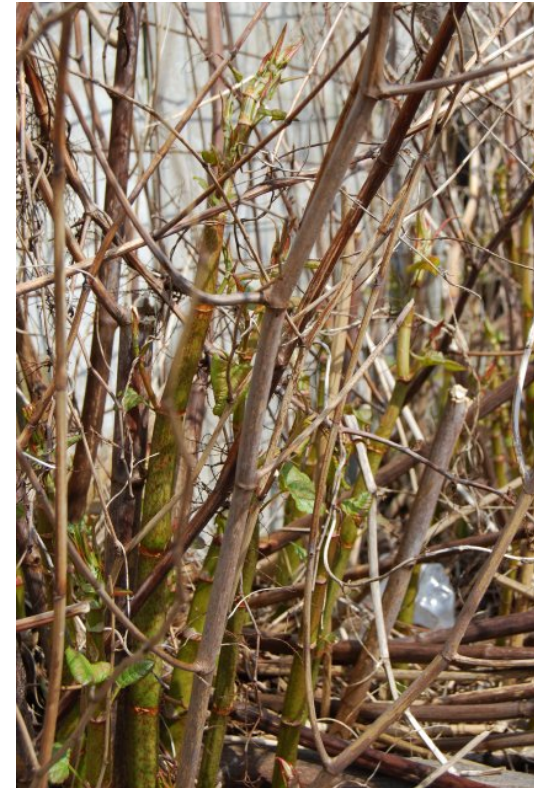
Japanese Knotweed - new shoots in spring